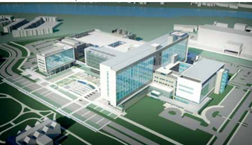
Carmel: 'round about right