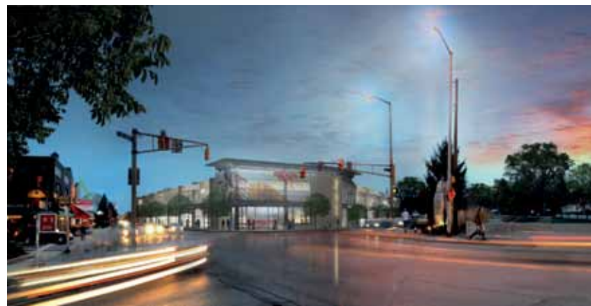
Broad Ripple Parking Garage and Retail Project